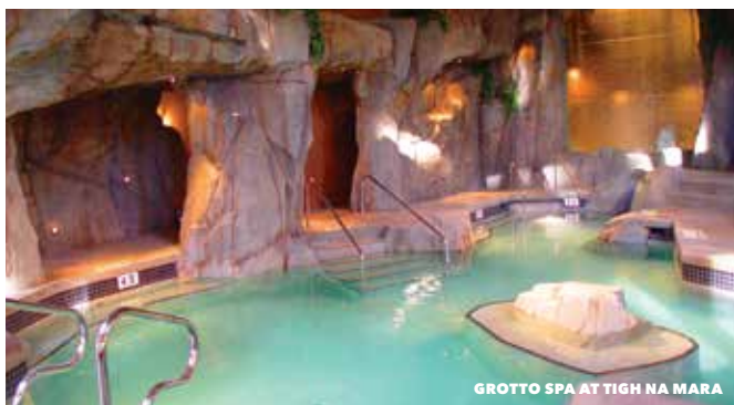
GROTTO SPA AT TIGH NA MARA

Call in advance to book time at the Grotto Spa, the largest mineral spa in BC, featuring a 2500 sq. ft. Mineral Bath, and exclusive dining at the Treetop Tapas & Grill.