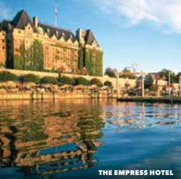
THE EMPRESS HOTEL