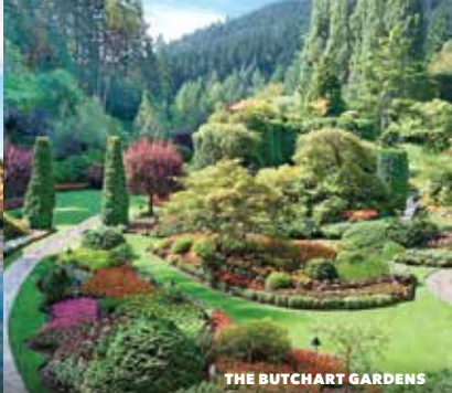
THE BUTCHART GARDENS