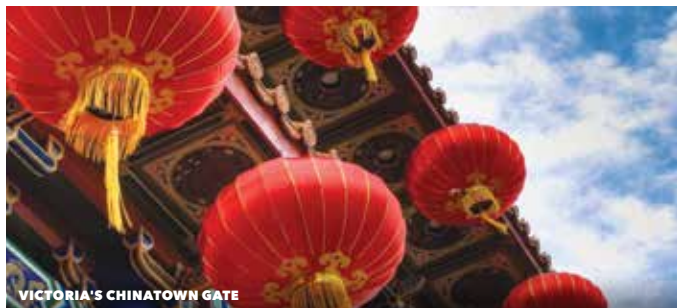
VICTORIA'S CHINATOWN GATE

Victoria was ranked the third friendliest city in the world by CondéNast 2014.