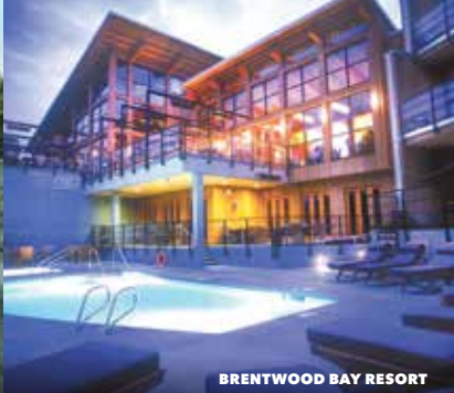
BRENTWOOD BAY RESORT