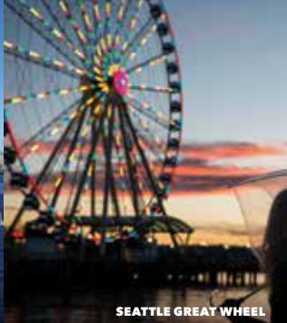
SEATTLE GREAT WHEEL