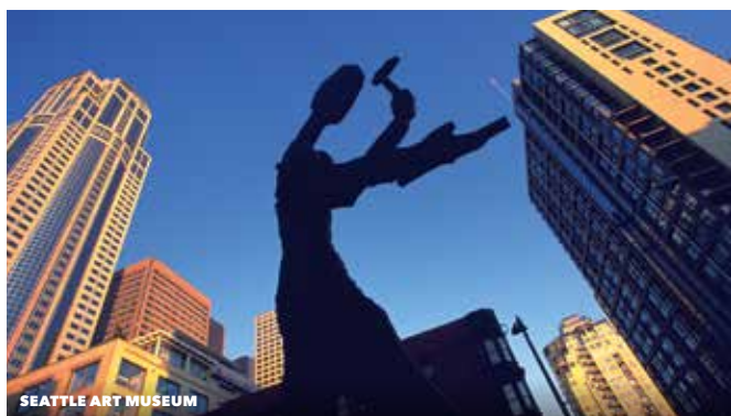
SEATTLE ART MUSEUM

† OPTIONAL Victoria Day Trip from $109pp/rt