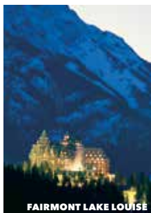
FAIRMONT LAKE LOUISE