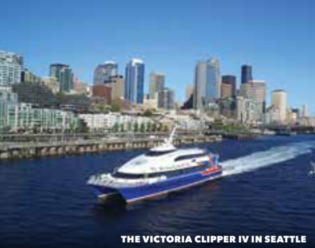
THE VICTORIA CLIPPER IV IN SEATTLE