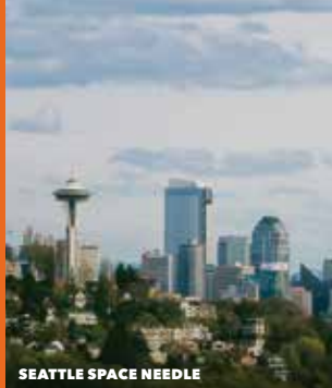
SEATTLE SPACE NEEDLE

The Emerald City is easily accessible by air, train or even cruise ship. When planning an Alaskan Cruise or a Pacific Northwest vacation, include this glimmering city with sights and activities including the Pike Place Market, Space Needle, Seattle Great Wheel, Fremont Troll, wineries, fine dining, shopping, museums, pro sports and more.