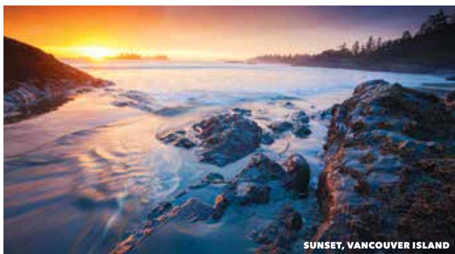
SUNSET, VANCOUVER ISLAND

» Find MORE THINGS TO SEE & DO on our blog: blog.clippervacations.com