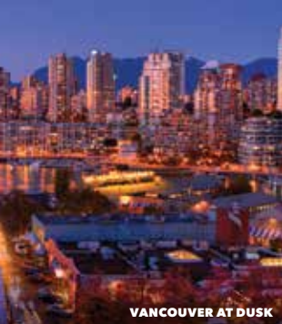
VANCOUVER AT DUSK