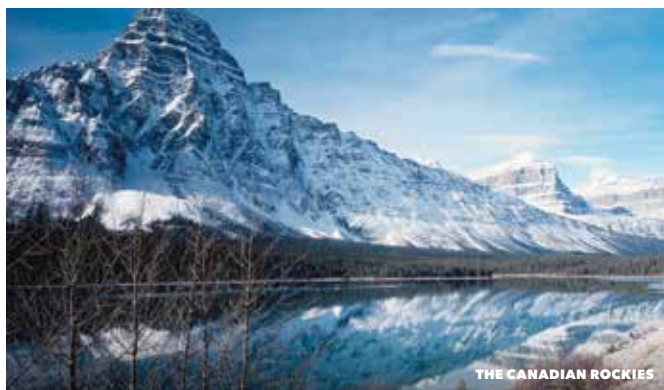
THE CANADIAN ROCKIES

» Find MORE THINGS TO SEE & DO on our blog: blog.clippervacations.com