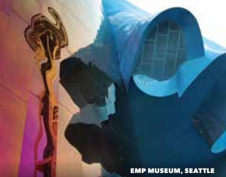
EMP MUSEUM, SEATTLE